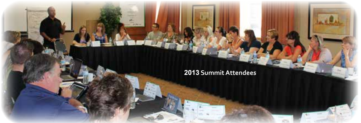
2013 Summit Attendees